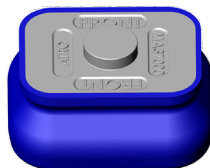
MA37000 Mack Upper Load Pad