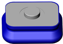
MA36500 Mack Upper Load Pad