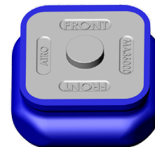
MA36000 Mack Lower Load Pad